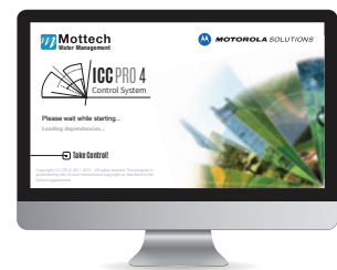
ICC PRO Software

As your business grows, your Motorola irrigation control system grows with you. The IRRInetCONNECT is easily upgradable to our reliable, centralized and remote control platform ICC PRO, recognized worldwide as the leading irrigation control and management software available today.